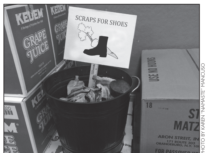
The raw materials for a new pair of shoes.