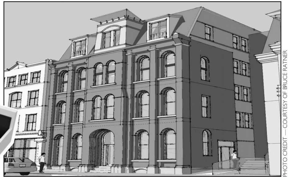
Above, architectural drawing of the new Coop condo building on Union Street, and a 3-D rendering of a sample two-bedroom apartment.