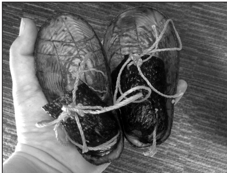
A freshly scooped pair of AvoKiddos in size Haas.