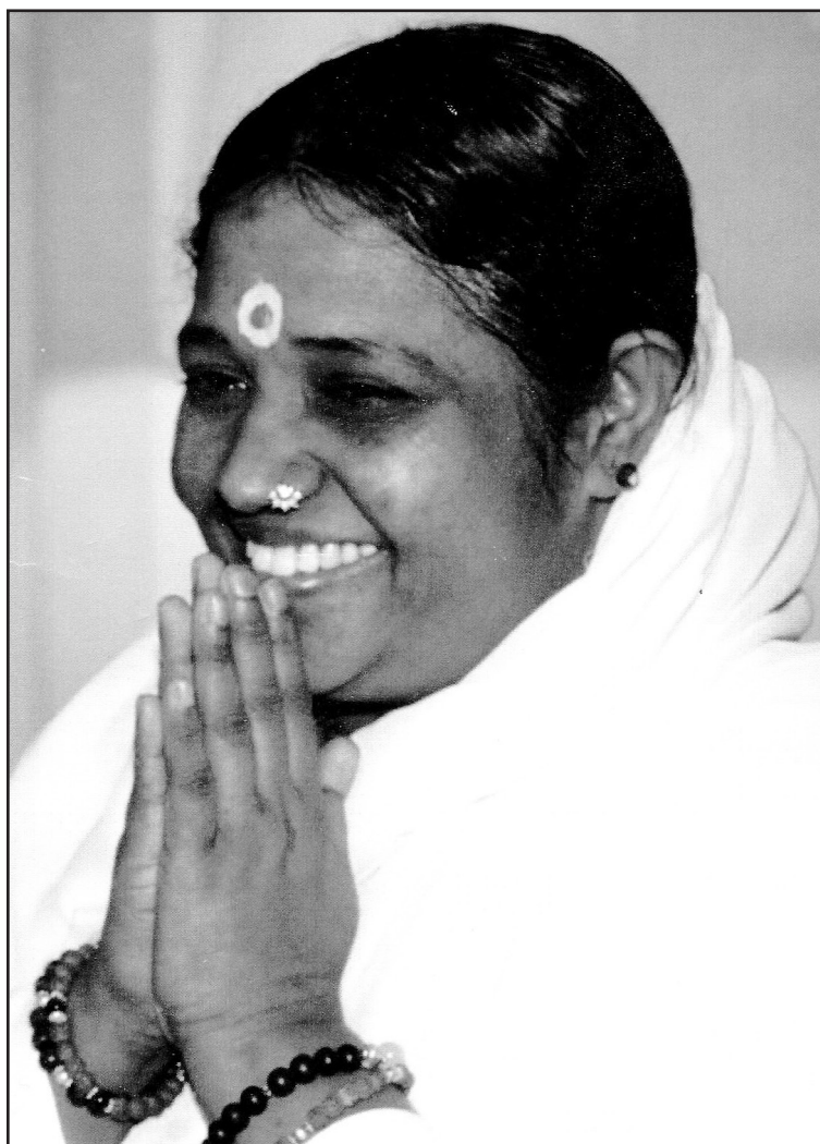
Amma prays she can help the members of the Park Slope Food Coop. The consensus is still out.

spiritual leader considered shaking hands with members on “alert” in lieu of a hug but thought better of it when several “active” members complained.